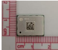
GNSS receiver only