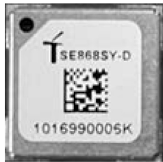
GNSS: receiver only